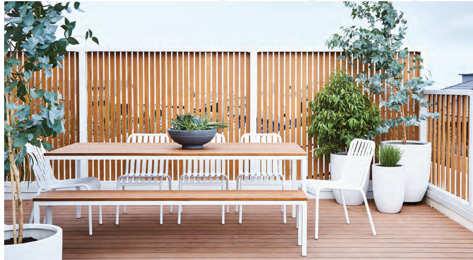
Photograph of Bellarine rear deck.