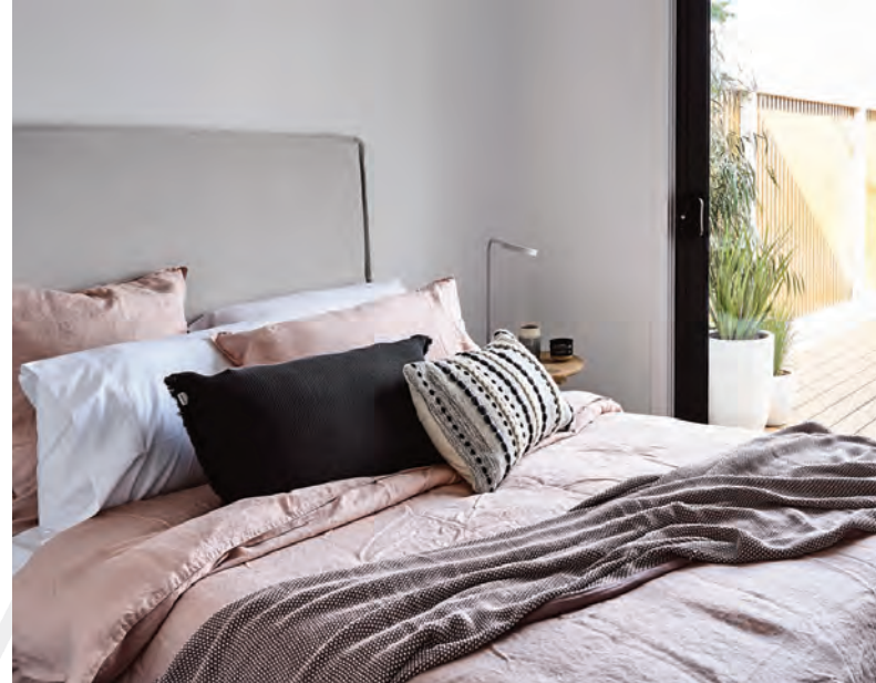
Photograph of Bellarine second bedroom.

The Leopold also features a 6 star energy rating with reverse cycle heating and cooling, double-glazing and advanced solar power ensuring comfort without compromise whilst natural fresh sea breezes ventilate and flow through the home. The result is a coastal retreat with restorative green spaces all round.