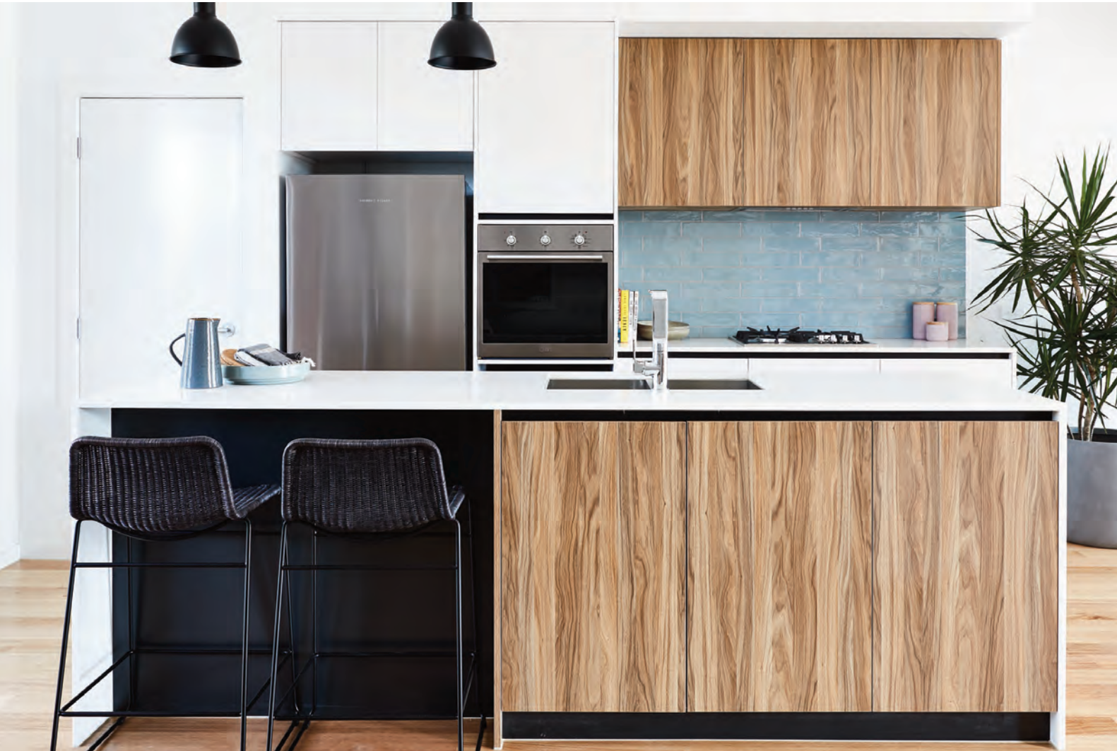
Photograph of Lonsdale design for illustrative purposes.