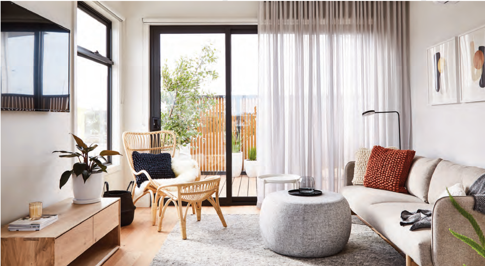
Photograph of Bellarine design.