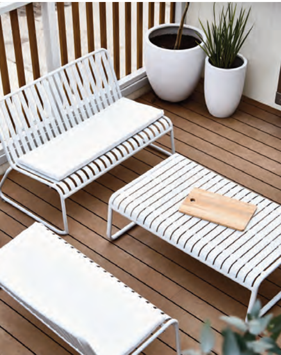
Photograph of Bellarine design.

Free flowing open plan living is at the heart of this home, with a superbly appointed kitchen featuring Ilve appliances, generous cupboard storage and a stunning U-shaped reconstituted stone kitchen benchtop. Offering stylish finishes and fittings, The Leopold's thoughtfully balanced colour scheme and durable materials have been selected to optimise the unique Surf Coast location and climate.