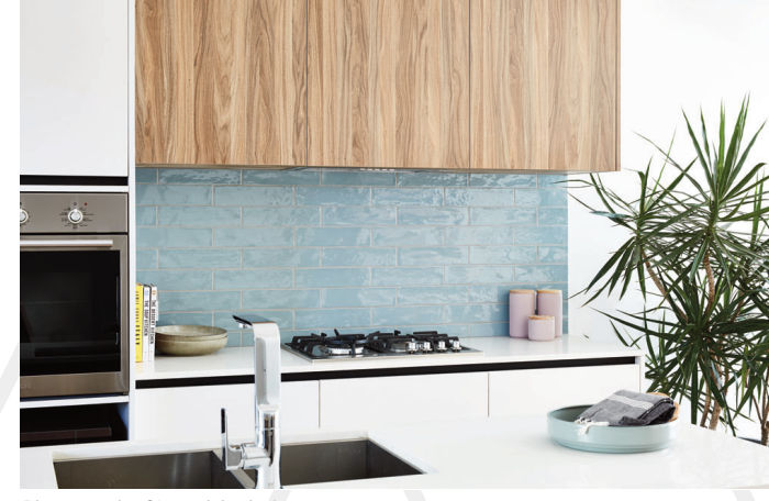
hotograph of Lonsdale design.

This release also provides homeowners with the enjoyment of an internal shared central garden and convenient on-site visitor parking.