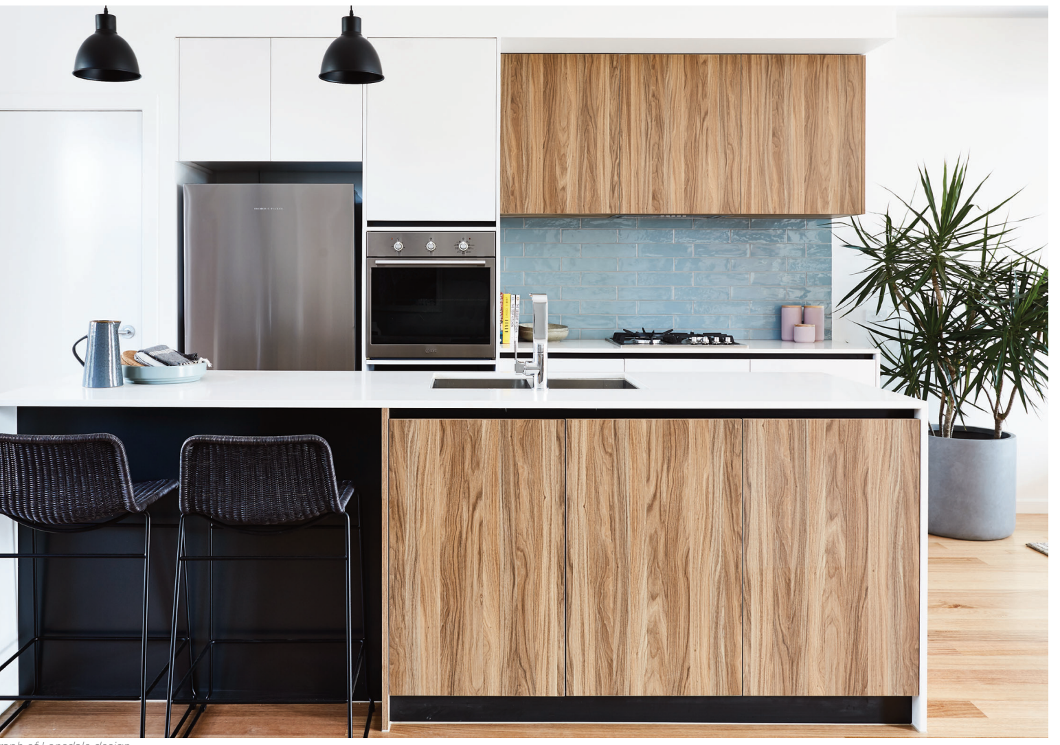
Photograph of Lonsdale design