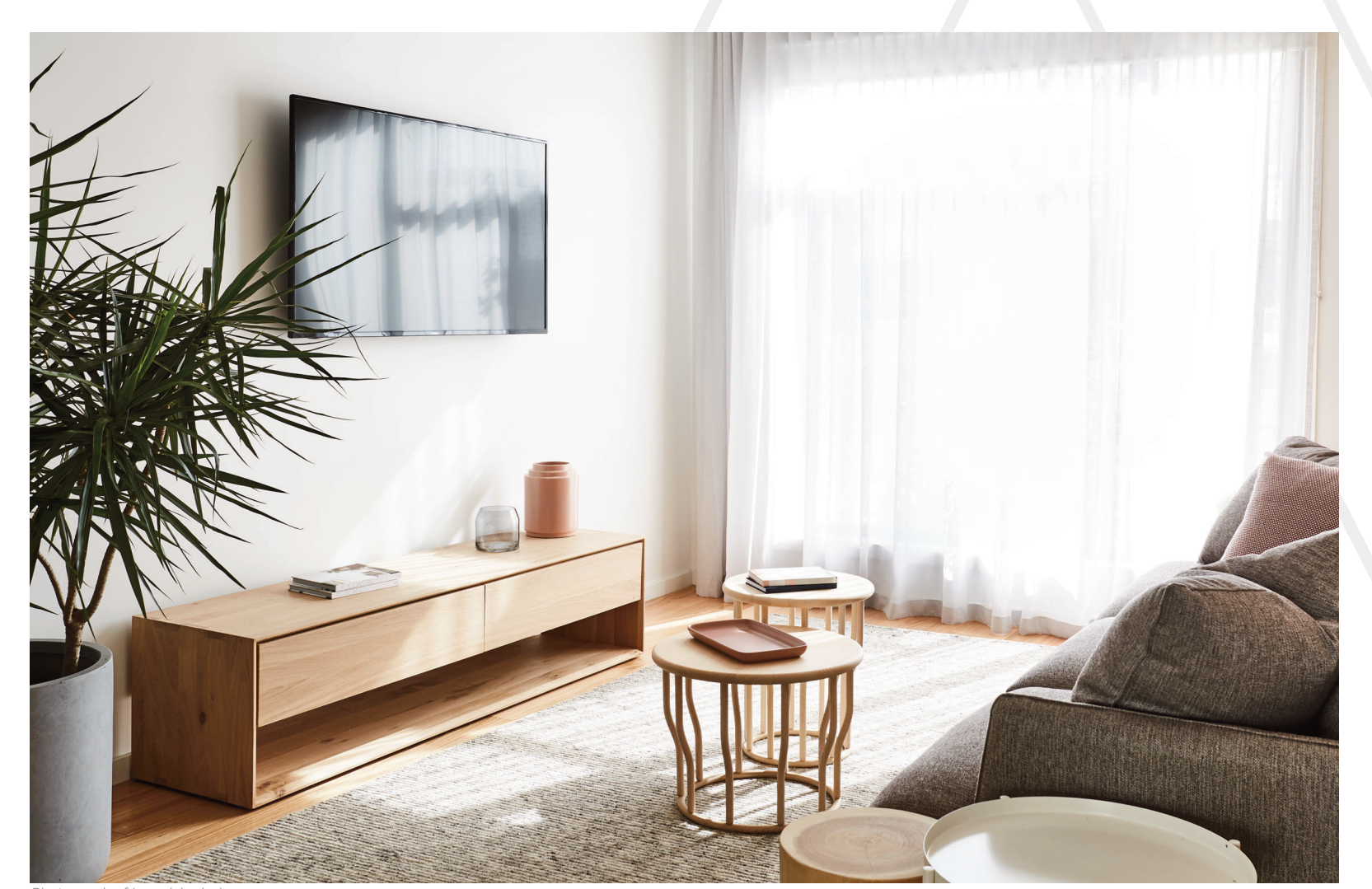
Photograph of Lonsdale design