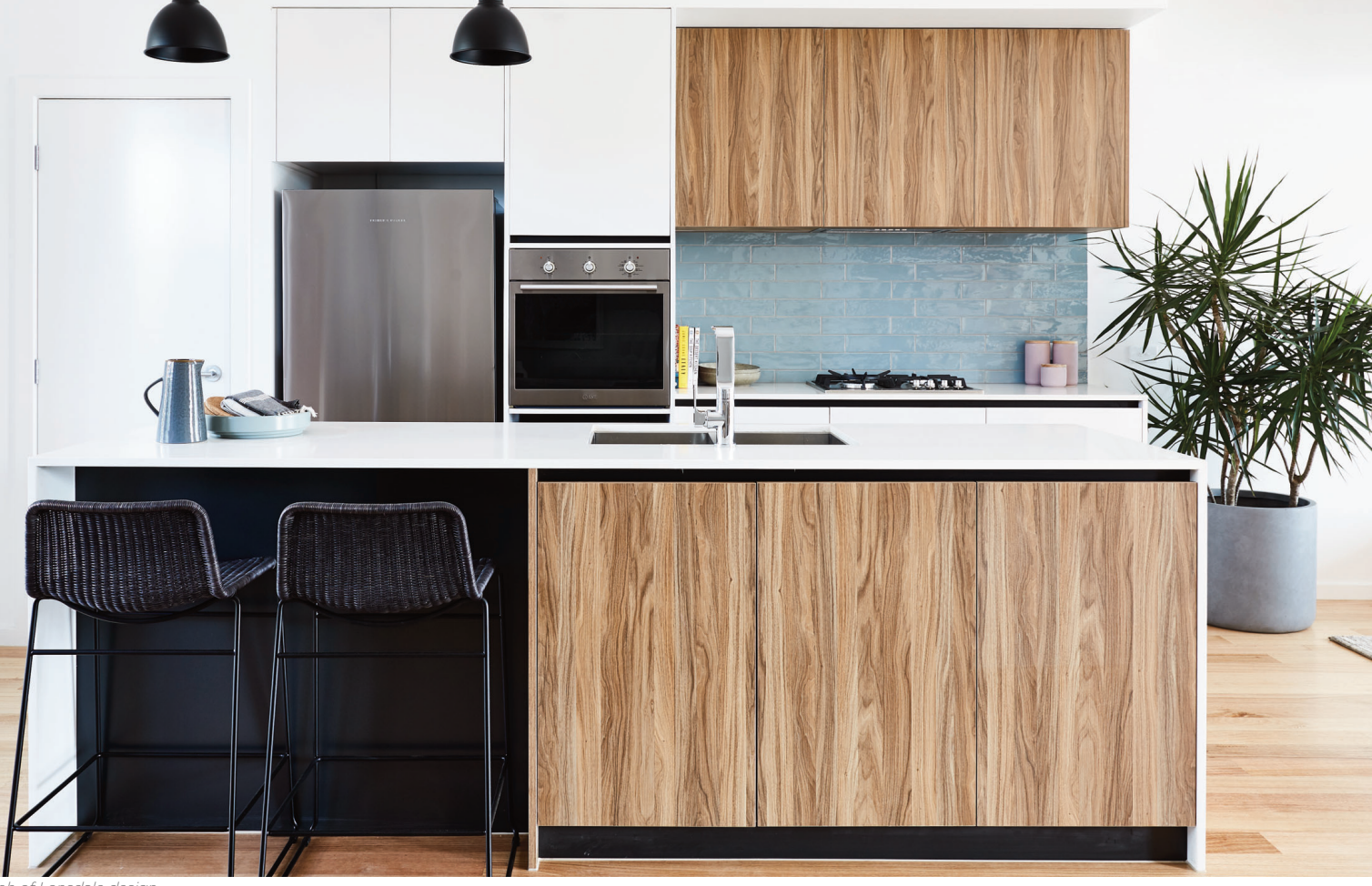
Photograph of Lonsdale design