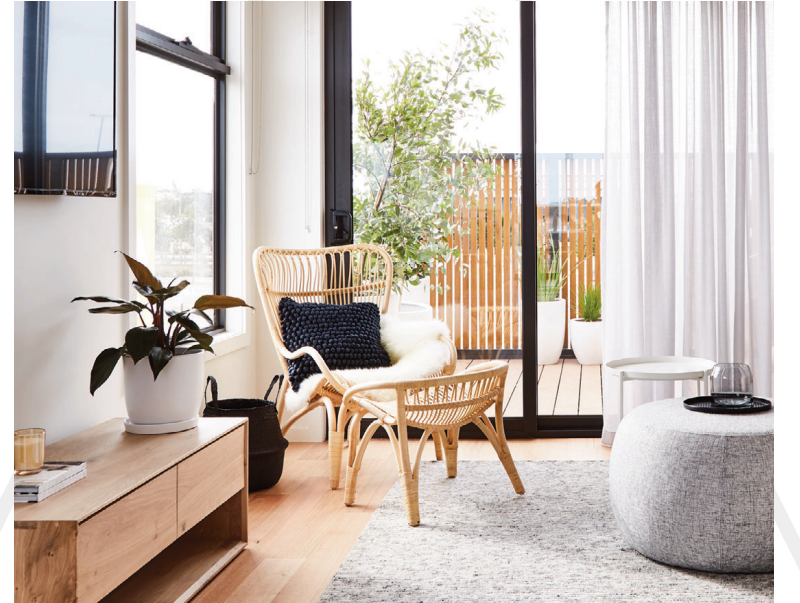
hotograph of Rellaring design

Available only in the Avant 'Edwards' release, the Airey's apartments are perfectly positioned between two public reserves at QUAY2. This release also provides homeowners with the enjoyment of an internal shared central garden and convenient on-site visitor parking.