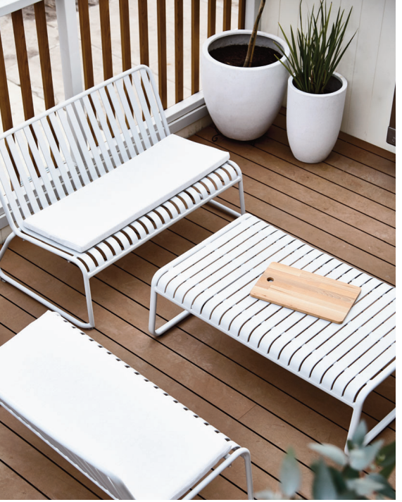
tograph of Bellarine design.

Offering stylish finishes and fittings, The Leopold's thoughtfully balanced colour scheme and durable materials have been selected to optimise the unique Surf Coast location and climate.