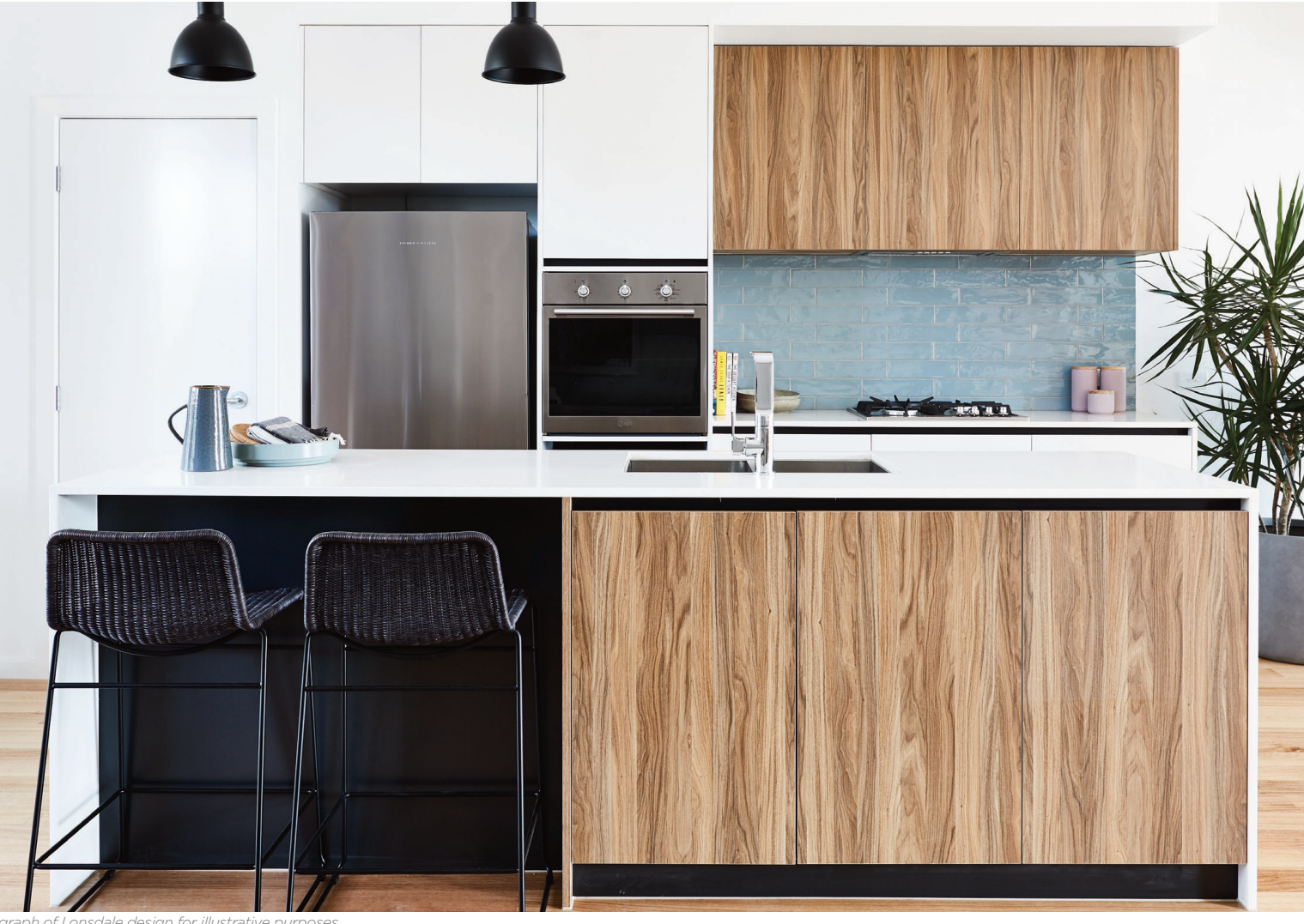
Photograph of Lonsdale design for illustrative purposes.