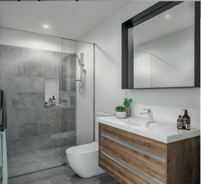
Artist Impressions are used throughout the brochure.

The living area opens up to a private balcony, while the dining area integrates with a large outdoor entertaining balcony. With separate zones for living, relaxing and entertaining, all filled with light from three sides, it's an extraordinary, luxury coastal home with low maintenance needs and enhanced security from its elevated siting.