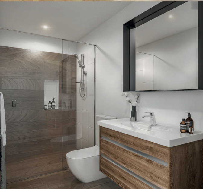
Artist Impressions are used throughout the brochure.

The second level features three spacious, air conditioned bedrooms, master with ensuite and central main bathroom. The kitchen is the heart of the home - spacious, elegant and well appointed with luxury finishes and quality appliances.